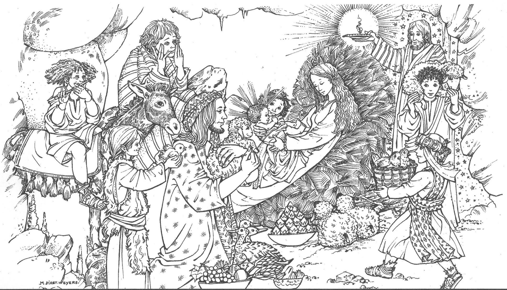
Artwork: Monique Piret-Weyers